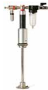
Air-powered agitator for LDG 5