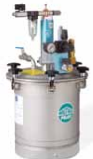
LDG 10 with air-powered agitator

All LDG 5 and LDG 10 pressure tanks with an upper outlet are supplied as standard with an integrated inliner.