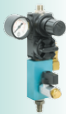
Control for marking containers