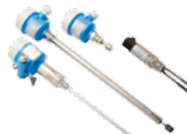
Fluid level sensors