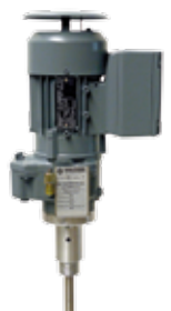
Electric agitator for LDG 10 and 20