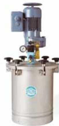
LDG 20 with electric agitator