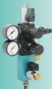
Air inlet fitting assembly complete with second regulator for connecting a second spray gun