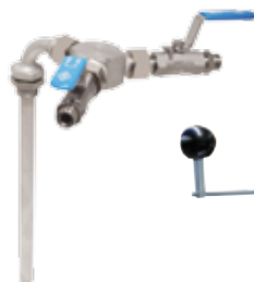
Material distributor for connecting a second or third consumer