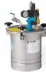
LDG 5 without agitator