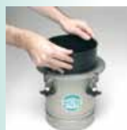
Inliner for LDG 10 and LDG 5 (see p. 43))